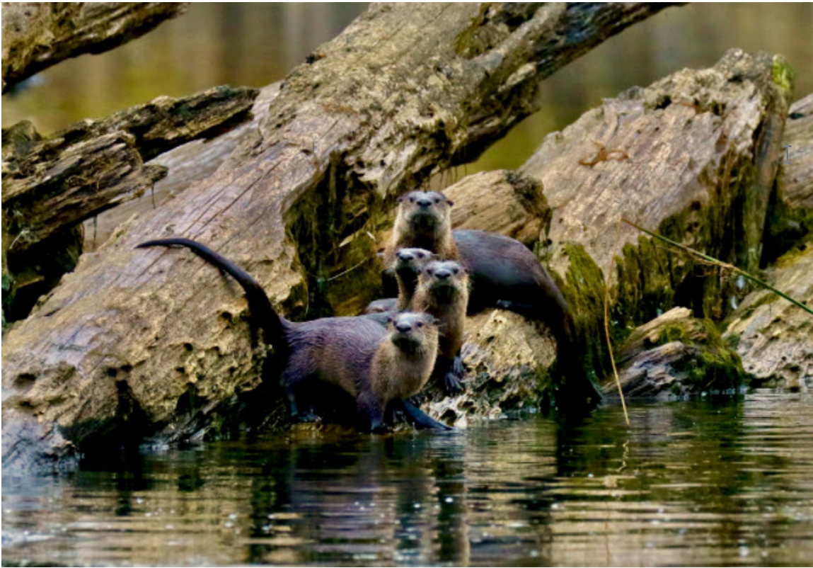
"Moods of Mill Bend" Wildlife Photo Winner, "Otter Family"