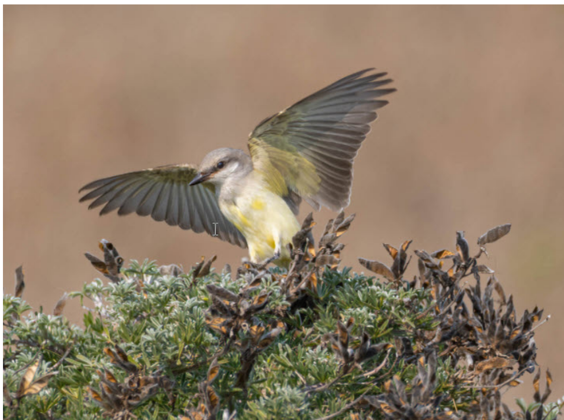
Moods of Mill Bend Grand Prize Winner, "Kingbird Stretch"