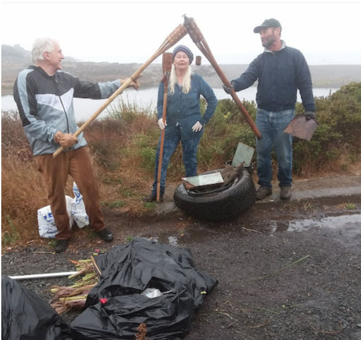
Volunteers participated in Coastal Cleanup Day September 18