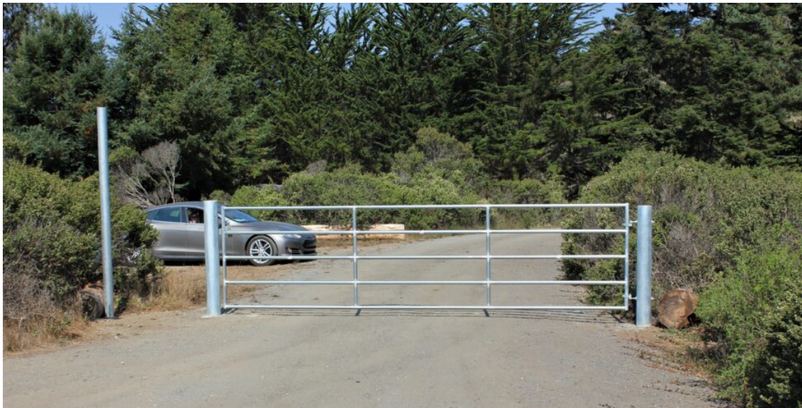
Mill Bend Gate