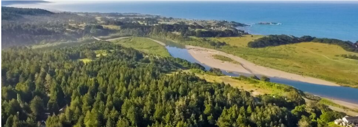
Mill Bend