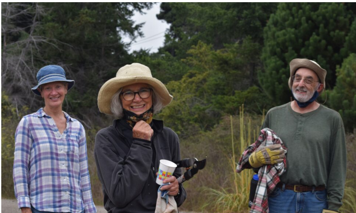
Volunteers, Photo by Anne Hanlon