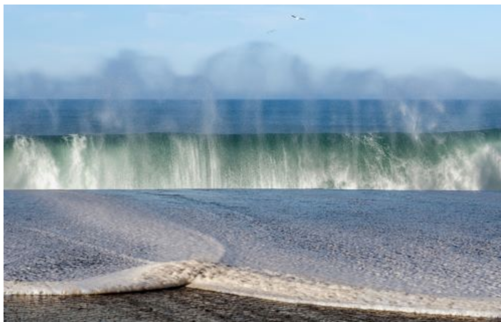
Rolling Curtain, Photo by Paul Brewer