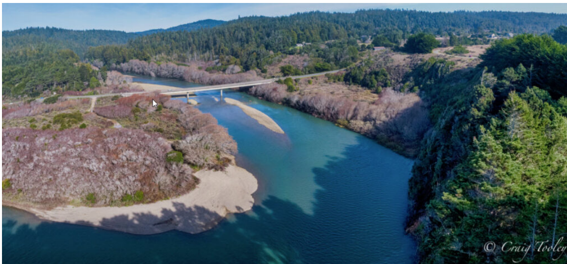
Mill Bend Aerial