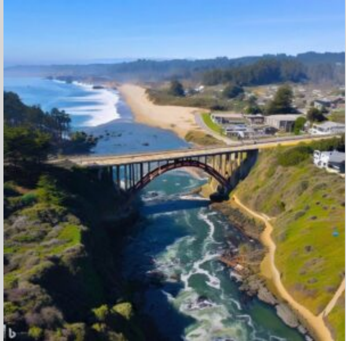
AI generated image of Mill Bend in 2123

For more AI generated photos, click here .