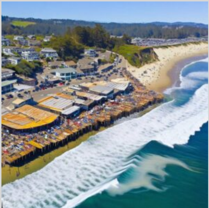
AI generated image of the town of Gualala in 2123