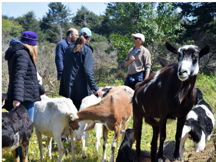
Goats cleaning up invasive weeds