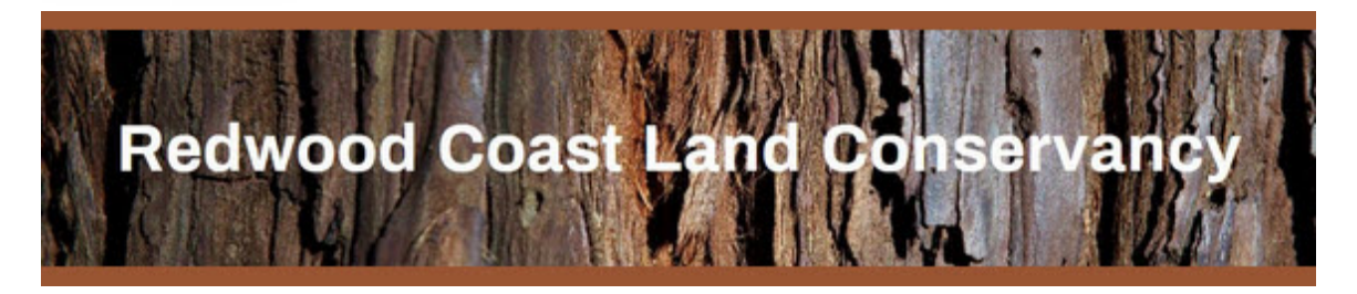
Winter 2020/2021 Newsletter