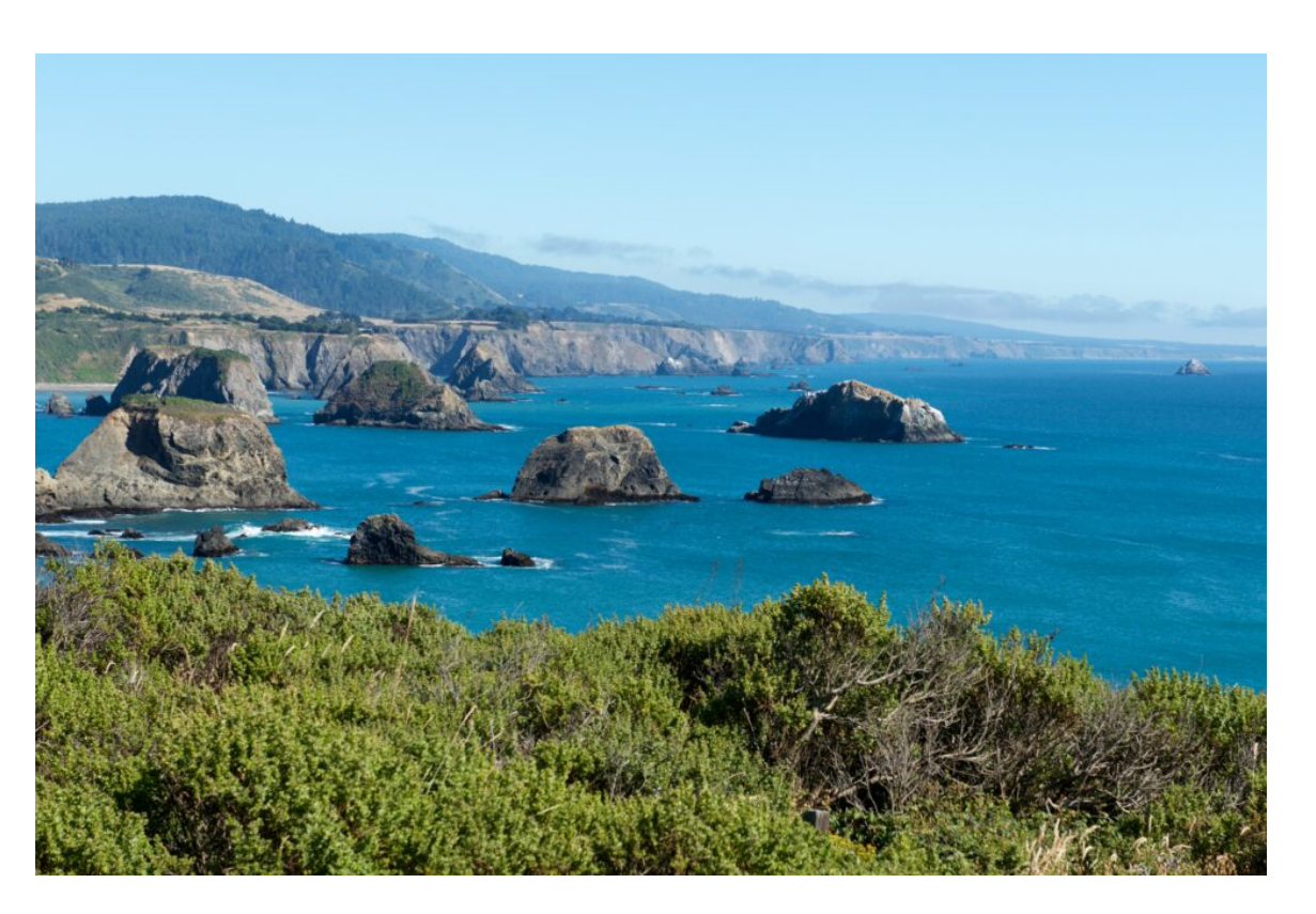
Mendocino coast sea stacks