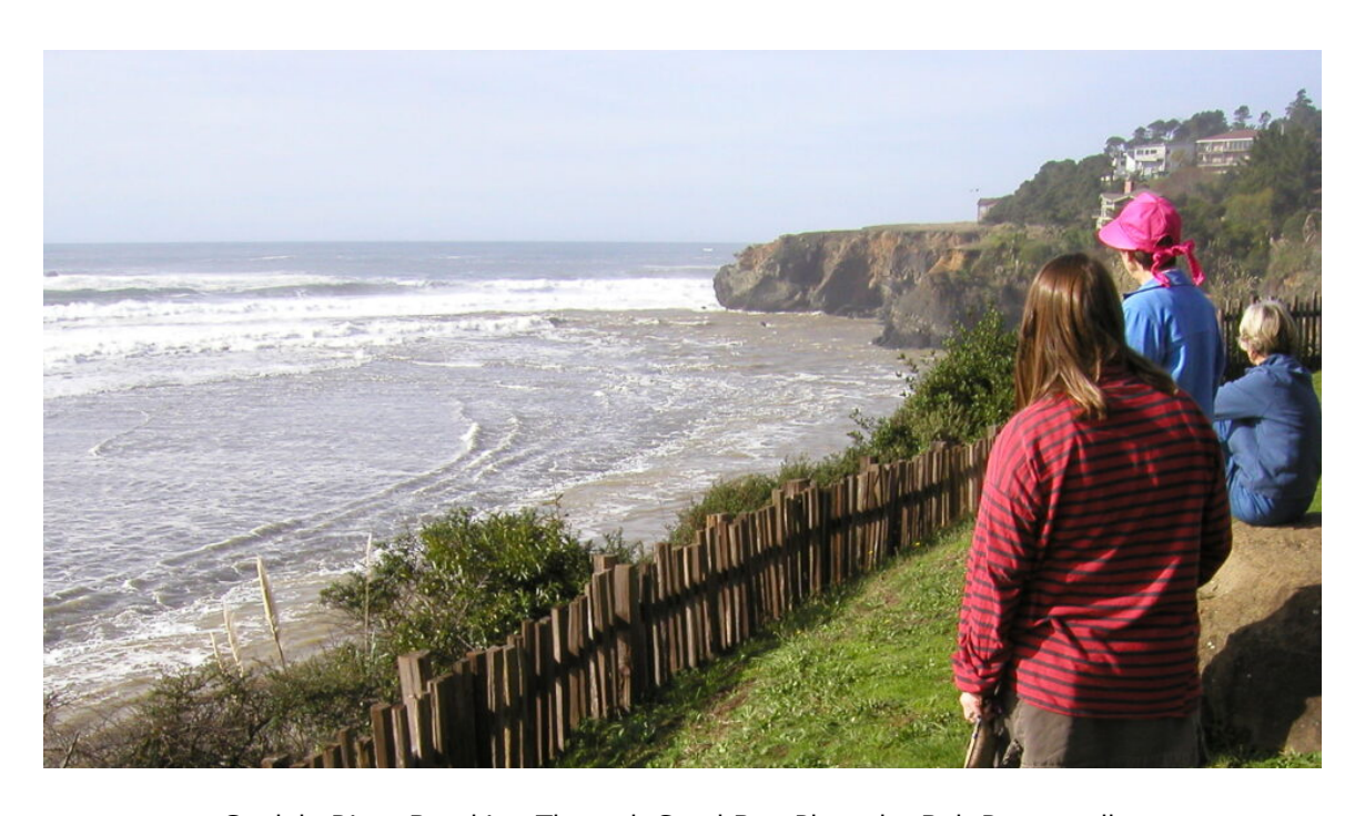
Gualala River Breaking Through Sand Bar