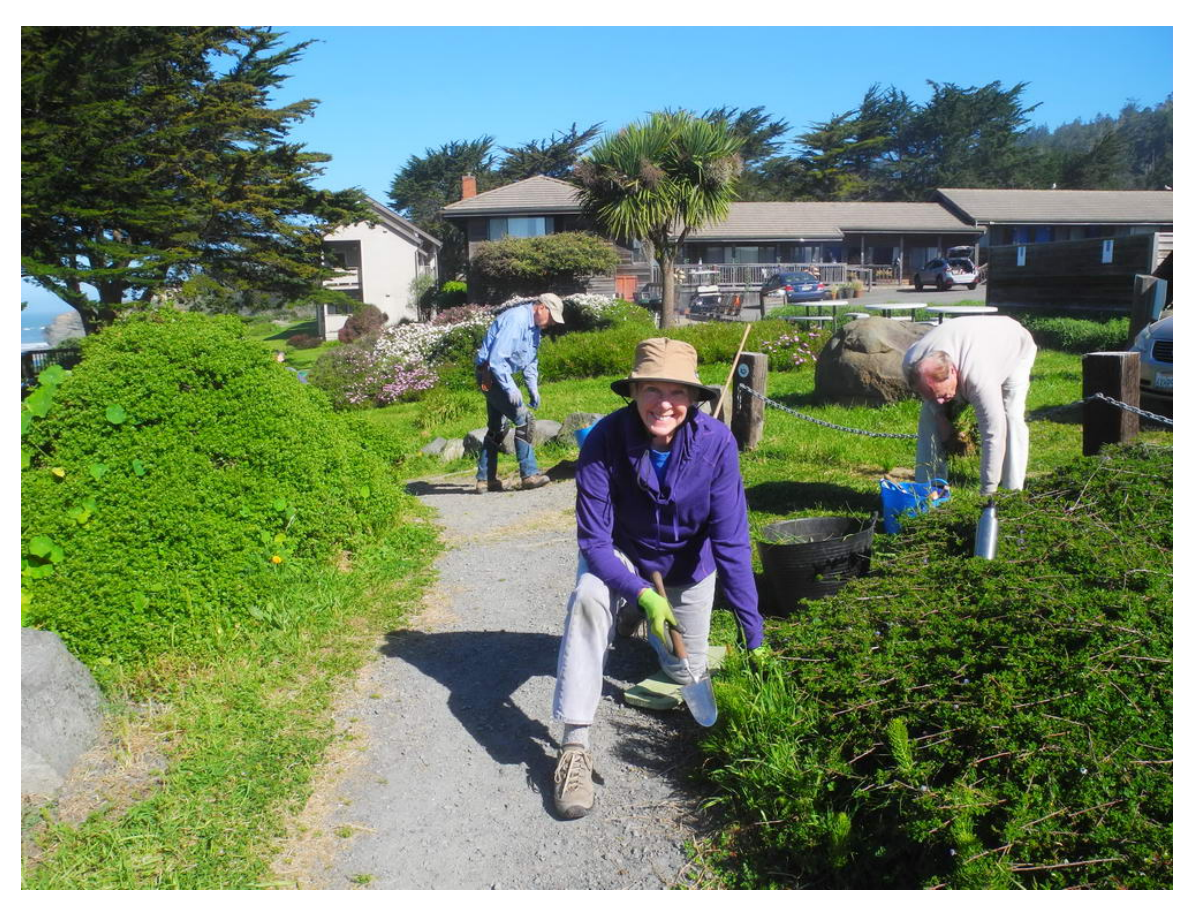
Gualala Bluff Trail Volunteers, photo by Mary Sue Ittner (taken prior to 2020)