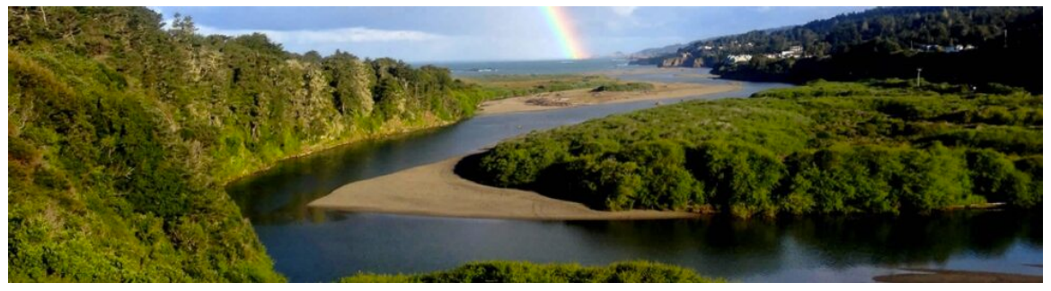
Mill Bend with Rainbow