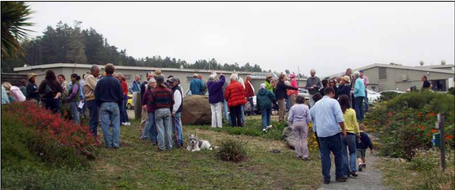
The crowd gathers