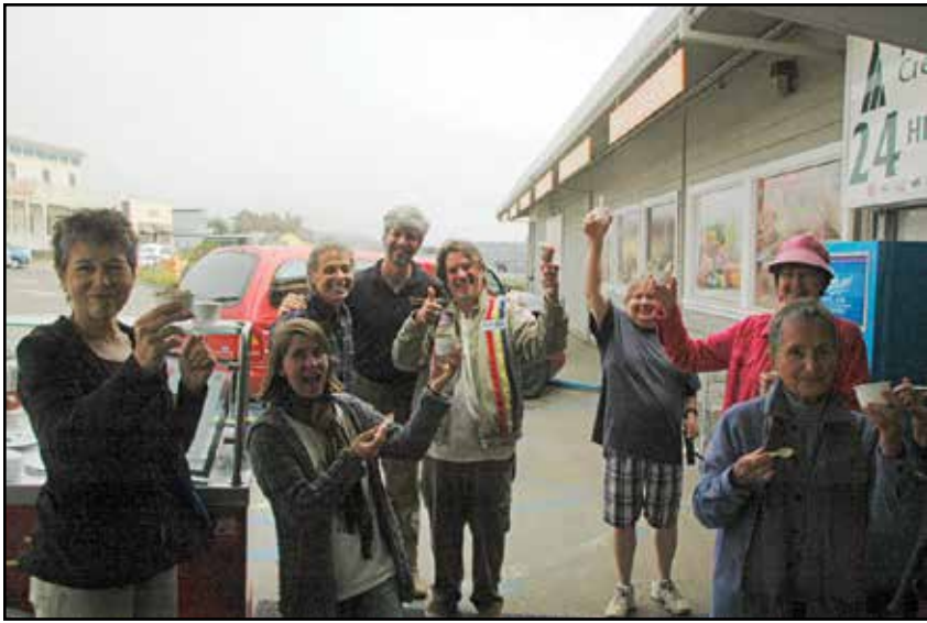
RCLC loves Pazzo Marco Creamery