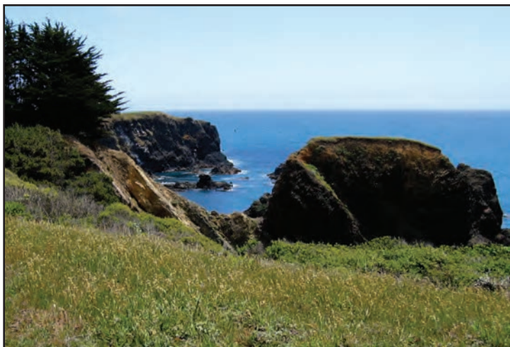
Preserving our local coast lands.

Additional funding for this project will be pursued with grants and donations.