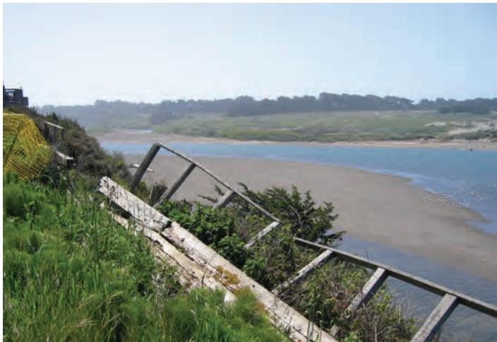
Waiting for replacement of the failed retaining wall behind the Surf Center has halted construction on the Gualala Bluff Trail since 2007.

Since then RCLC has been waiting for the retaining wall issue to be resolved so that work on completing the trail