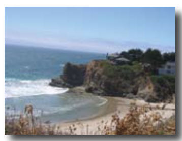
View of Cooks Beach