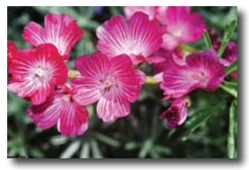
Checkerbloom, (sidalcea malviflora)