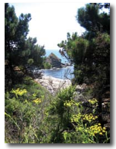
St. Orres Beach

RCLC yet. St. Orres' stream divides the cove neatly in half, and the sides of the cove are steep and provide little space for construc-