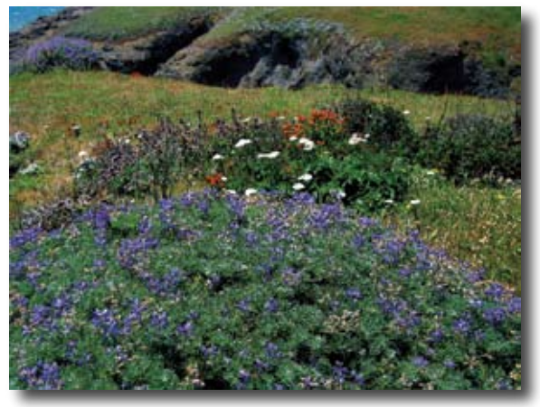
Wildflowers now carpet Hearn Gulch bluffs as nature reclaims damaged areas.

heritage can take many twists and turns and may, on occasion, require creative solutions along the way. Mendocino County, the California Coastal Commission and CalTrans have worked together with RCLC to provide improved public access at Hearn Gulch while protecting sensitive habitat from unnecessary disturbance.