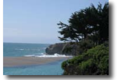
View from Gualala Bluff Trail