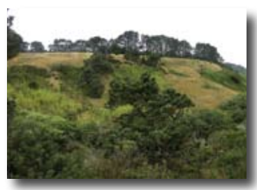
Hathaway Creek Easement