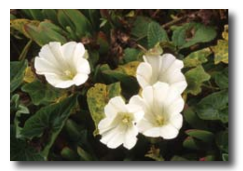
Coastal Morning Glory, (Calystegia purpurata ssp. Saxicola), Photo courtesy of Doreen L. Smith

The process of protecting the California coast's exceptional natural