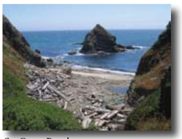
St. Orres Beach