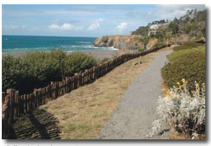
Bluff trail.

Sheep fencing was added for safety, shrubs have been cut back, areas weeded, the trail dug out, and new shale added. Some of this was paid for by the grant, but volunteers did a lot of the work. We are already receiving compliments on how nice the trail now looks.