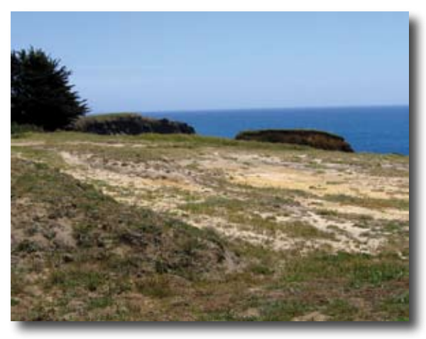
A parking area will be provided so that fragile areas damaged by vehicle traffic can be restored.

With the help of our local community, RCLC acquired an additional two acres on the south end of the bluff last April. This acquisition will enable RCLC to provide protection of the entire bluff top and to improve public access to the headlands. Funding was provided by a major grant from the State Coastal Conservancy and matching funds from RCLC contributors.