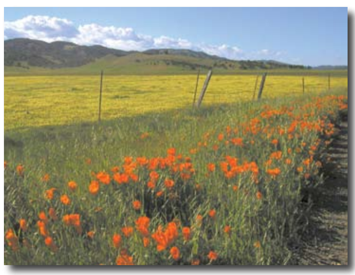
Spring flowers in Bear Valley.

Delicious homemade desserts will be served, and you will be able to bid on a number of unusual auction items, offered by local experts and enthusiasts to highlight the beauty and wonders of our natural surroundings. A few of the known items are a gourmet dinner for six served on the Gualala Bluff trail, a spring bird walk for six followed by a home cooked brunch, and a custom guided spring wildflower walk at Salt Point with lunch in a special spot