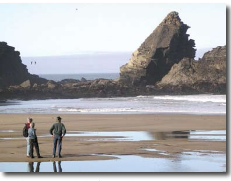
Sea stacks on Bonham Beach.