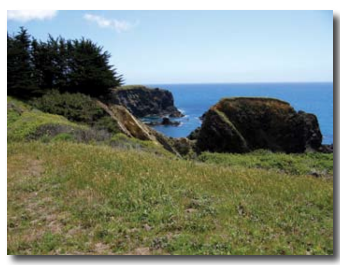
New Hearn Gulch purchase protects headlands view to the south.

Trails out to the headlands, the Sea Cave Cove overlook and the beach will be developed, with protective sheep fence and signage as needed.