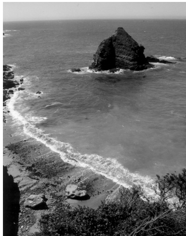
A view from the top of the bluff.