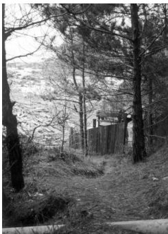
The trail will be improved.

RCLC is now engaged in planning improvements and getting the necessary building permits from CALTRANS and the Mendocino County Planning and Building Department. With permits in hand, RCLC will apply to the State Coastal Conservancy for help in funding the trail-building work. We hope to complete the work and open the access for public use in spring or summer of 2003. RCLC is highly pleased to gain this easement; it provides for public access along a stretch of the coast where there has been little or no public access up to now. The beach and ocean are quite close to Highway 1 here, the access trail being less than 200 feet long. Another exciting RCLC project! 🌲