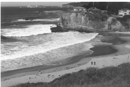
The way Cook's Beach and Fish Rock might look from a viewing platform.

The Bonham Family has offered to dedicate portions of their land at Bourns Landing, including access to Cook's Beach. Here are some of the views that RCLC representatives saw on a recent Field Trip. We scouted out possibilities, for example there might be a viewing platform from above and improved trail access to the beach. More news on this project. 🌲