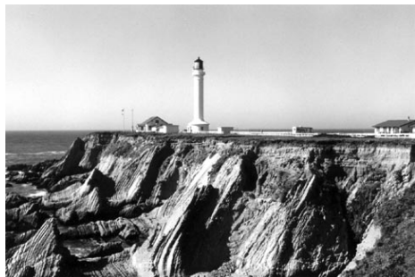
To see the Ranch land, drive or take a walk from Rollerville Junction to the Point Arena Lighthouse. The Ranch land for sale lies on both sides of the road.

The Conservation Land Group, Inc., has announced that 1860 acres of the Stornetta Brothers Coastal Ranch is for sale, its price to be determined by an independent appraisal. The owners will consider selling the property for conservation purposes. The land surrounds the Point Arena Lighthouse and is immediately south of Manchester State Park. Resources include over two miles of Pacific Ocean coastline and prime habitat for threatened and endangered species including the Point Arena mountain beaver (see RCLC Fall/Winter 2000 Newsletter), snowy plover, red-legged frog, and Mendocino coast Indian paintbrush. RCLC enthusiastically supports the public acquisition of the ranch and offers to assist with appropriate conservation negotiations to protect the recreational, educational, agricultural, scenic and open space opportunities. Readers, please email or call us with your ideas. 🌲